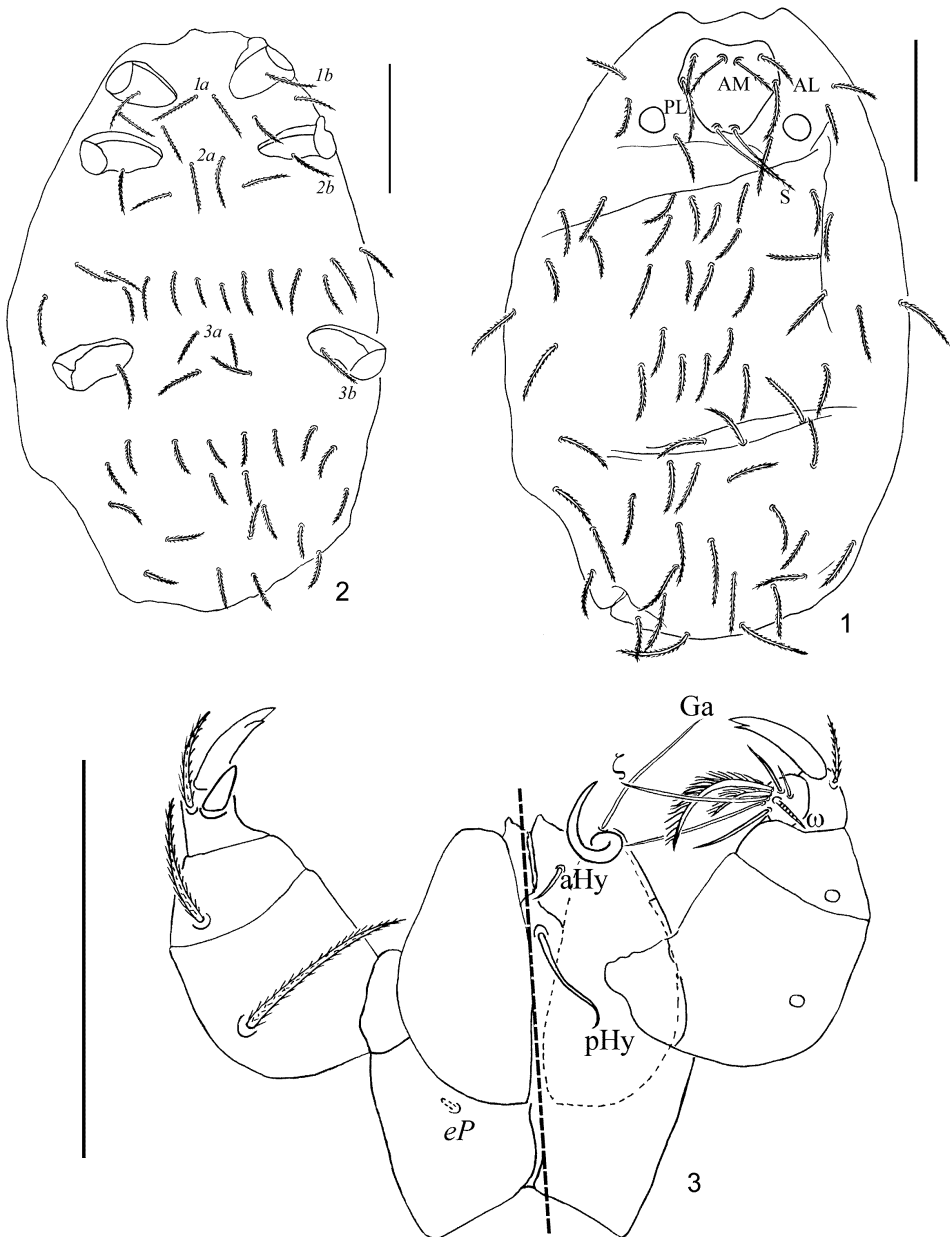
Figs 1–3. Marantelophus sanandajensis Hakimitabar et Saboori sp. n. (larva): 1 = dorsal view of idiosoma, 2 = ventral view of idiosoma, 3 = ventral view (right) and dorsal view of gnathosoma (left). Scale bars: 100 \mu m.