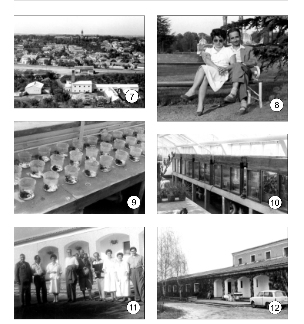
Fig. 7. The new laboratory with official residence as seen from the tower of the Karmelita church

Fig. 8. TIBOR JERMY and his wife at Héviz